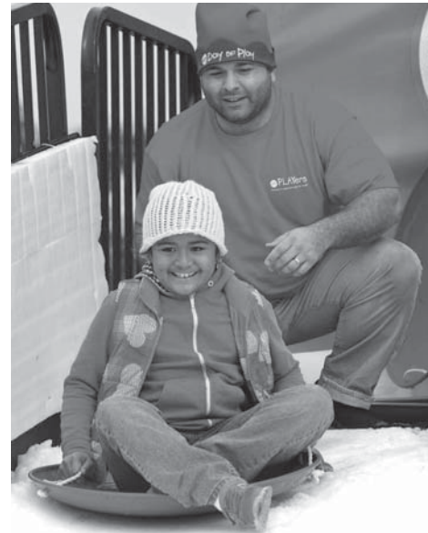
Mattel hosted a series of philanthropic events at Mattel headquarters and elementary schools throughout Los Angeles, bringing unique play experiences featuring more than 390 total tons of snow and hands-on activities to underserved children.

The holiday season in the South Bay is more likely to include a backyard cookout and walks on the windswept beaches than snowball fights and sled runs, but thanks to the efforts of Mattel the students at Washington Elementary School got to enjoy a snow day. As part of Mattel's 12 Days of Play, the company transformed Washington Elementary's playground into a winter wonderland with a sled run and a snow field for snowball throwing, along with activities based around popular Mattel