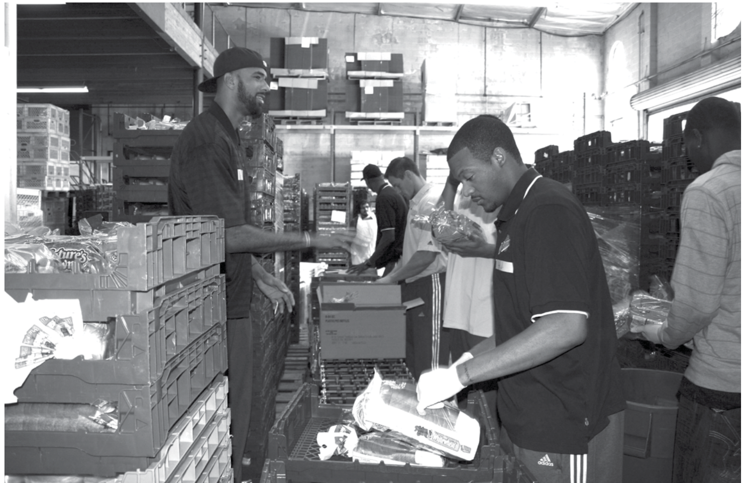
The Los Angeles D-Fenders are teaming up with the Los Angeles Regional Food Bank to host a Food Drive at the D-Fenders home games in December (12/13, 12/15). Please bring canned foods, nonperishable items or a cash donation to the game where there will be a donation table set up at the entrance. Individuals will receive a D-Fenders prize for their charitable donation. All of the donations will be given to the L.A. Regional Food Bank on December 17th when the D-Fenders volunteer their morning assisting with the Food Sorting Project. If you would like more information on how you can donate or volunteer please email D-FendersCR@d-fenders.com.